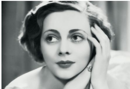
Celia Johnson on fame page 14