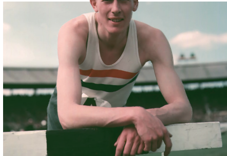
Roger Bannister, 70 years on page 30