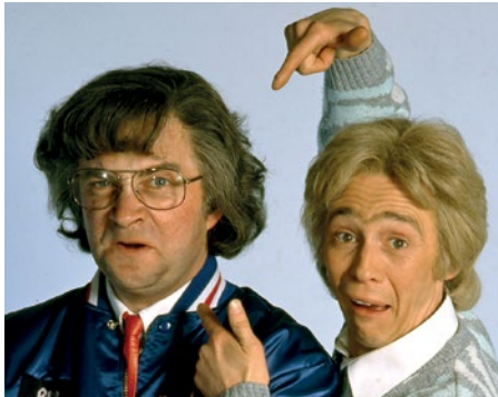
That old Radio One vibe page 22