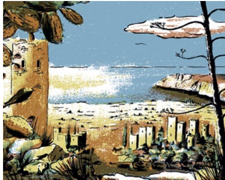
For love of the Mani page 30