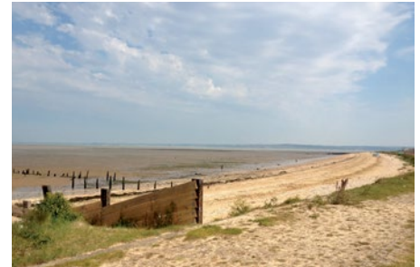
Sheppey – isle that time forgot page 88