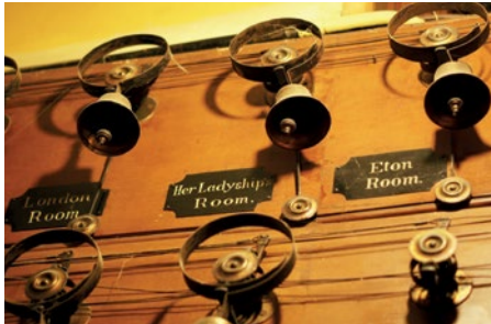
Downton Abbey – a class act page 14